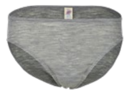
70 1310 091 – light grey mélangé

● 100% cotton (organic), drop stitch sz. 34/36, 38/40, 42/44, 46/48