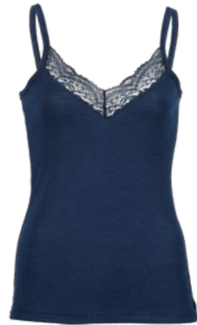
70 4050 33 - navy-blue

70% virgin wool (organic)/30% silk, fine rib sz. 34/36, 38/40, 42/44, 46/48