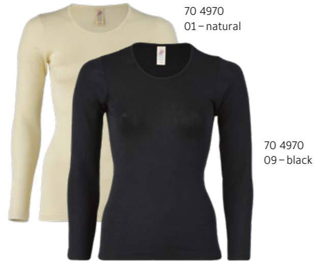
70 4970 01 - natural

● 70% virgin wool (organic)/30% silk, fine rib sz. 34/36, 38/40, 42/44, 46/48