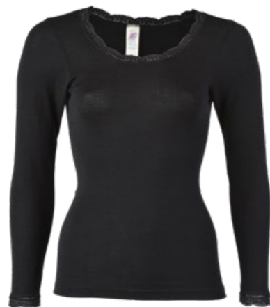
70 4890 09 - black

70% virgin wool (organic)/30% silk, fine rib sz. 34/36, 38/40, 42/44, 46/48