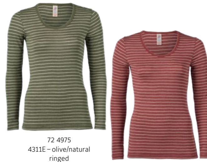
72 4975 4311E - olive/natural ringed

● 70% virgin wool (organic)/30% silk, fine rib sz. 34/36, 38/40, 42/44, 46/48