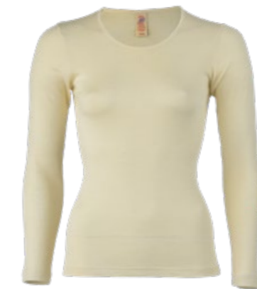
40 4974 01 - natural

● 100% virgin wool (organic), fine rib sz. 38/40, 42/44, 46/48