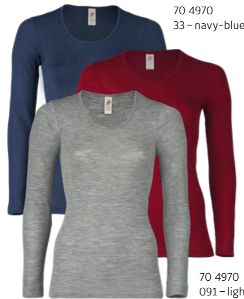
70 4970 33 - navy-blue