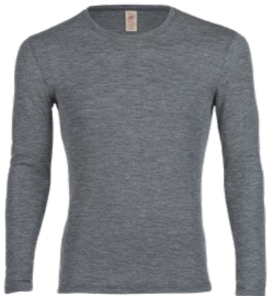
40 4815 98 – slate

● 100% virgin wool (organic), fine rib sz. 46/48, 50/52, 54/56