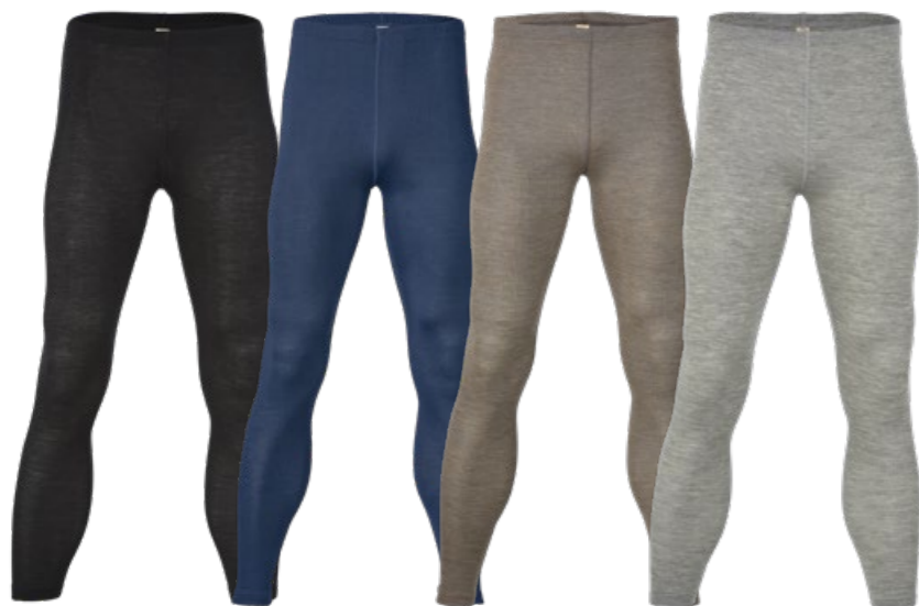
70 1900 09 - black

● 70% virgin wool (organic)/30% silk, fine rib sz. 46/48, 50/52, 54/56