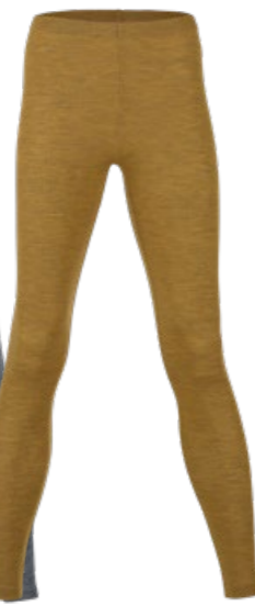
40 1500 018E - saffron mélange