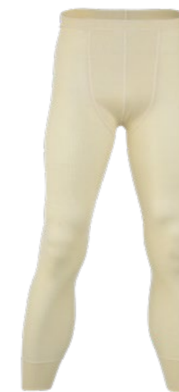
70 1940 01 - natural

● 70% virgin wool (organic)/30% silk, fine rib sz. 46/48, 50/52, 54/56