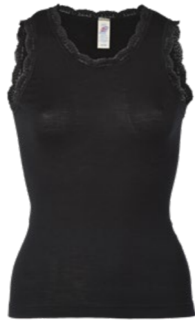
70 4070 09 - black

70% virgin wool (organic)/30% silk, fine rib sz. 34/36, 38/40, 42/44, 46/48