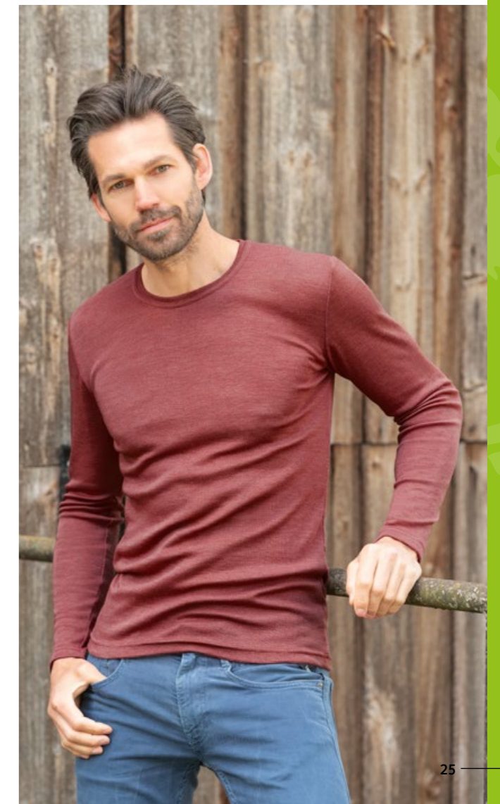
70 4815 52E – copper