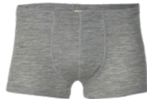
70 1795 091 - light grey mélangé

● 70% virgin wool (organic)/30% silk, fine rib sz. 46/48, 50/52, 54/56