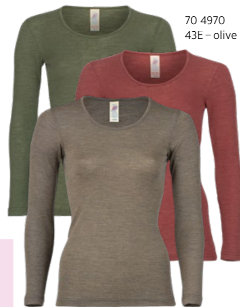
70 4970 43E - olive