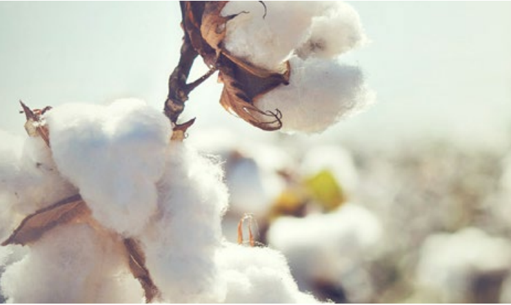
Cotton – soft and hard-wearing

For our clothes we use the following raw materials: organic cotton, organic Merino virgin wool and the especially proven blend of Merino virgin wool and silk.