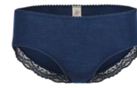
70 1360 33 – navy-blue

70% virgin wool (organic)/30% silk, fine rib sz. 34/36, 38/40, 42/44, 46/48