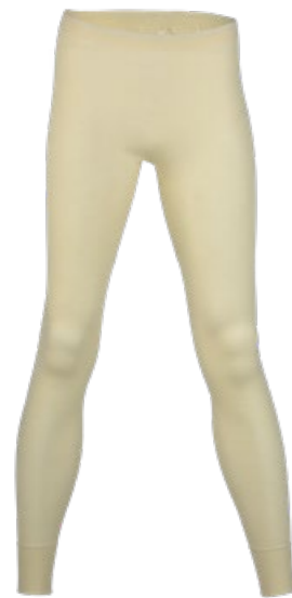
40 1604 01 - natural

● 100% virgin wool (organic), fine rib sz. 38/40, 42/44, 46/48