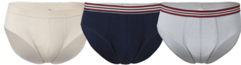
87 1775 01E - natural 87 1776 38E - indigo 87 1776 90E - silver

● 100% cotton (organic), drop stitch sz. 46/48, 50/52, 54/56