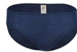
70 1310 33 – navy-blue

● 70% virgin wool (organic)/30% silk, fine rib sz. 34/36, 38/40, 42/44, 46/48