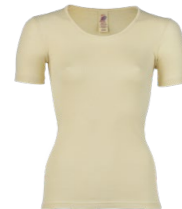
40 4874 01 - natural

● 100% virgin wool (organic), fine rib sz. 38/40, 42/44, 46/48