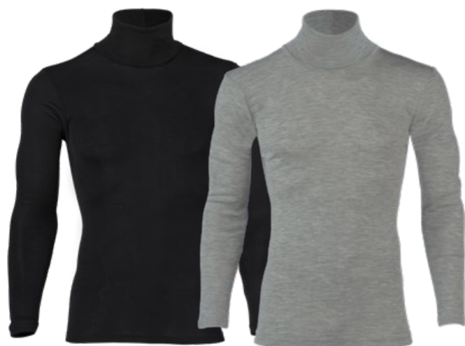
70 4410 09 – black

● 70% virgin wool (organic)/30% silk, fine rib sz. 46/48, 50/52, 54/56