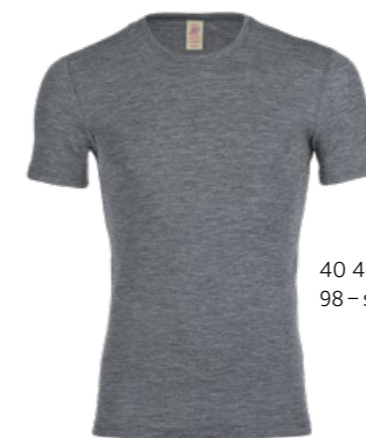
40 4805 98 - slate

● 100% virgin wool (organic), fine rib sz. 46/48, 50/52, 54/56