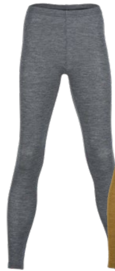
40 1500 98 - slate