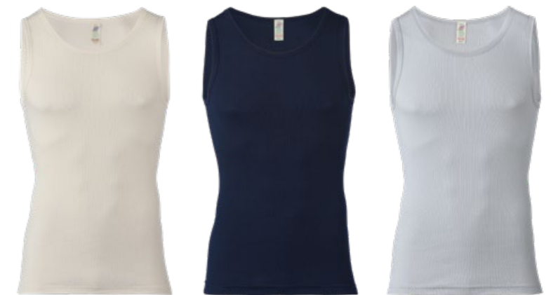
87 4006 01E - natural 87 4006 38E - indigo 87 4006 90E - silver

● 100% cotton (organic), drop stitch sz. 46/48, 50/52, 54/56