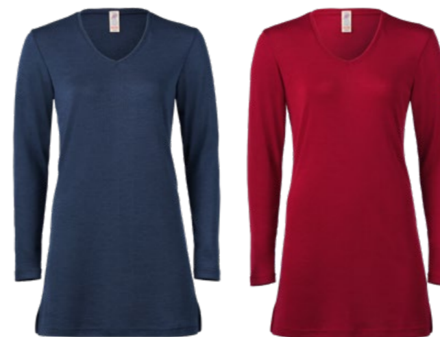
70 4952 33 - navy-blue

70% virgin wool (organic)/30% silk, fine rib sz. 34/36, 38/40, 42/44, 46/48