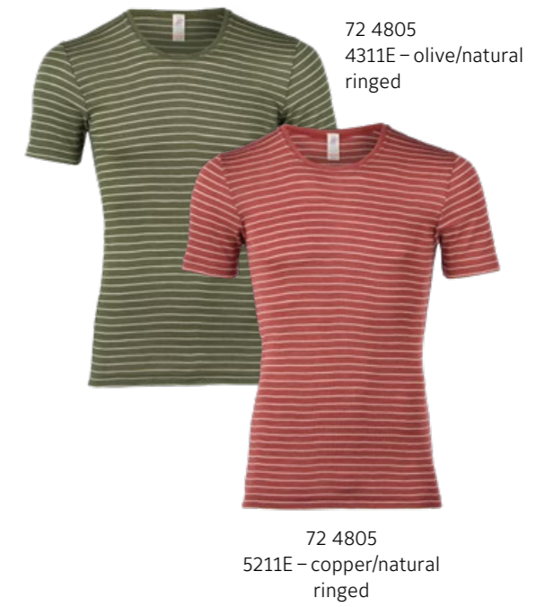
72 4805 4311E – olive/natural ringed

● 70% virgin wool (organic)/30% silk, fine rib sz. 46/48, 50/52, 54/56