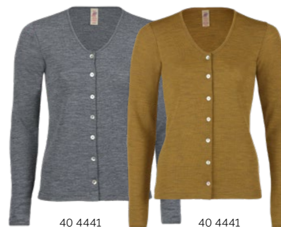
40 4441 98 – slate

● 100% virgin wool (organic), fine rib sz. 34/36, 38/40, 42/44, 46/48