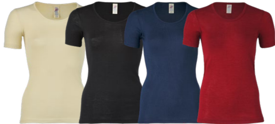
70 4870 01 - natural 70 4870 09 - black 70 4870 33 - navy-blue 70 4870 66E - mauve

● 70% virgin wool (organic)/30% silk, fine rib sz. 34/36, 38/40, 42/44, 46/48