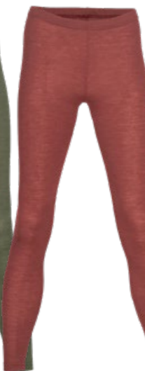
70 1500 52E - copper