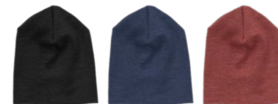
70 5544 09 – black

● 70% virgin wool (organic)/30% silk, fine rib sz. 1