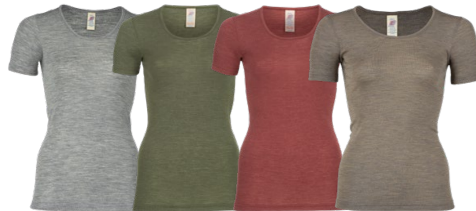
70 4870 091 - light grey mélangé 70 4870 43E - olive 70 4870 52E - copper 70 4870 75 - walnut