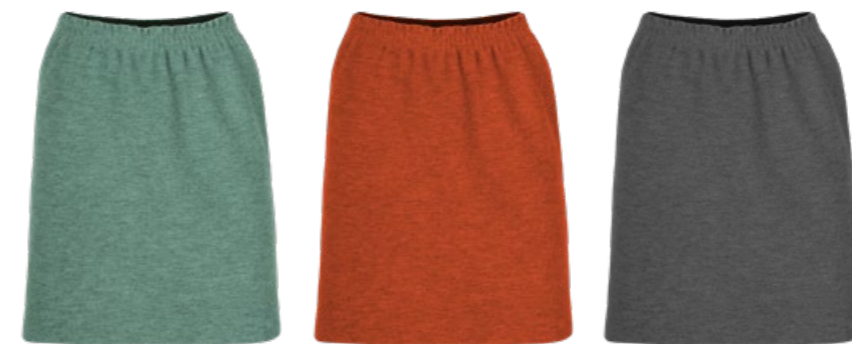
59 1803 032E – jade mélange 59 1803 072E – magma mélange 59 1803 096E – lava grey mélange

New quality! Ladies' skirts made of boiled wool