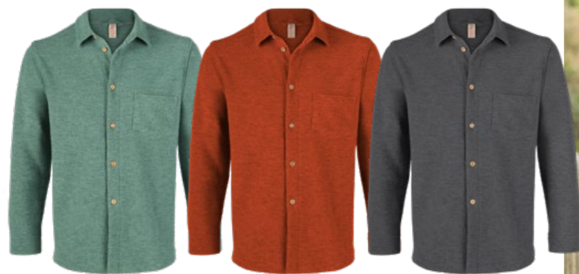
59 4310 032E – jade mélange 59 4310 072E – magma mélange 59 4310 096E – lava grey mélange