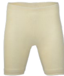
70 1320 01 - natural

● 70% virgin wool (organic)/30% silk, fine rib sz. 38/40, 42/44, 46/48