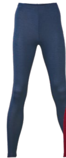
70 1500 33 - navy-blue