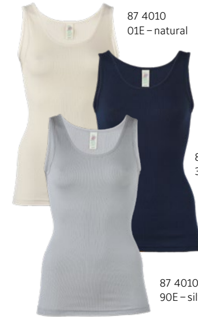
87 4010 01E - natural

● 100% cotton (organic), drop stitch sz. 34/36, 38/40, 42/44, 46/48