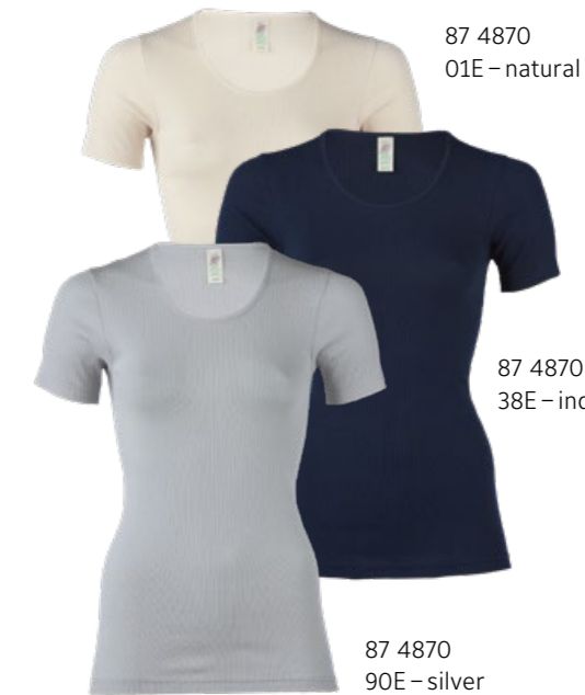
87 4870 01E - natural

● 100% cotton (organic), drop stitch sz. 34/36, 38/40, 42/44, 46/48