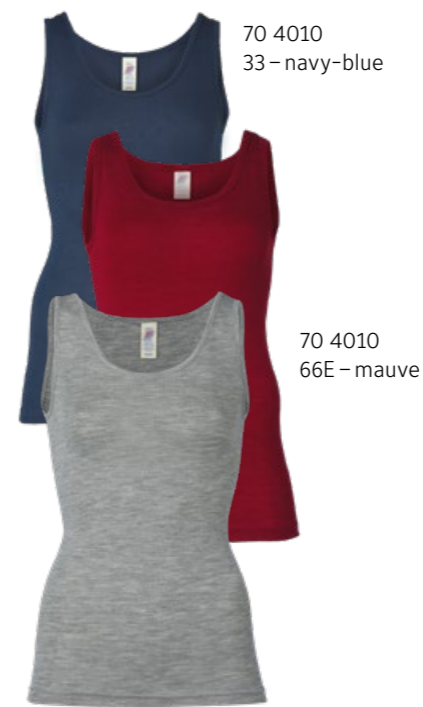
70 4010 33 - navy-blue