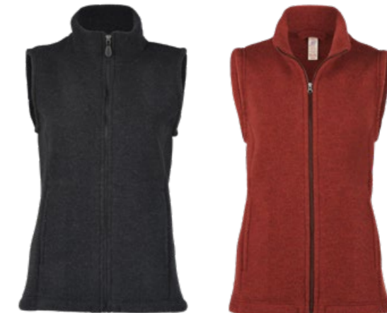
58 4460 090 – black mélange