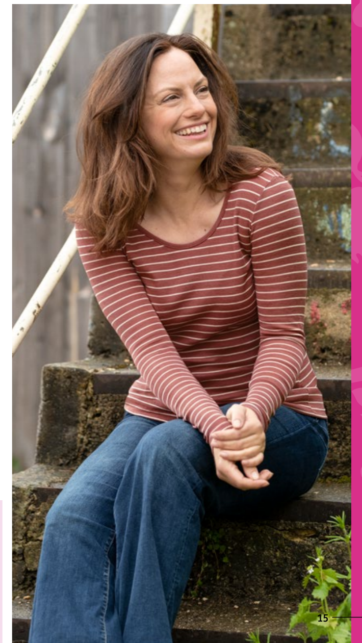
72 4975 5211E - copper/natural ringed