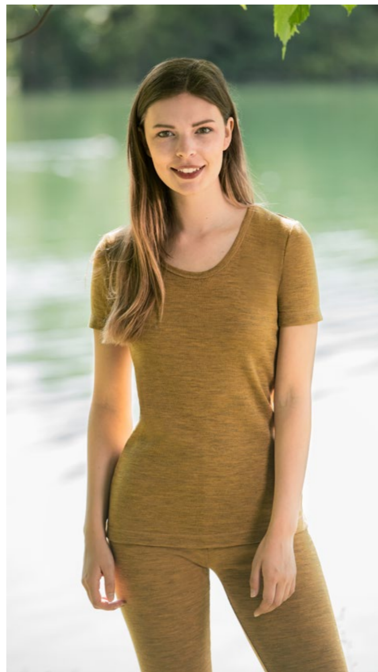
70 4040 66E - mauve