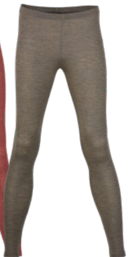
70 1500 75 - walnut