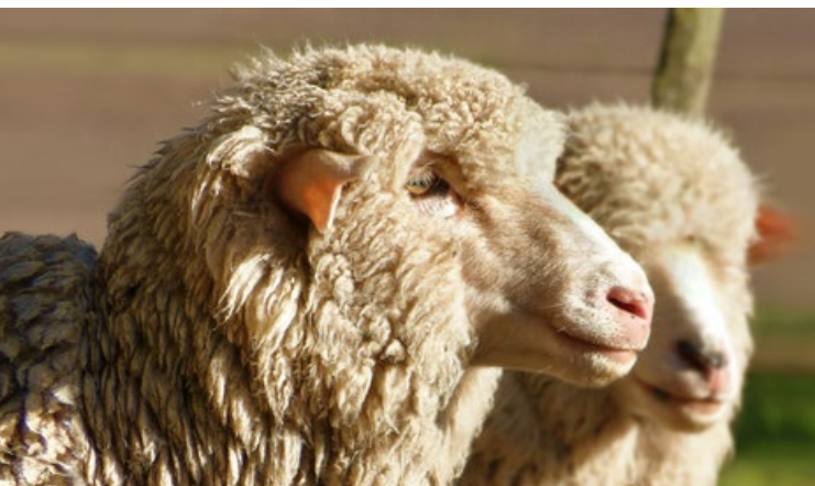
Merino virgin wool – to feel wool means to feel well