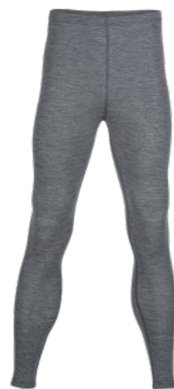
40 1900 98 - slate

● 100% virgin wool (organic), fine rib sz. 46/48, 50/52, 54/56