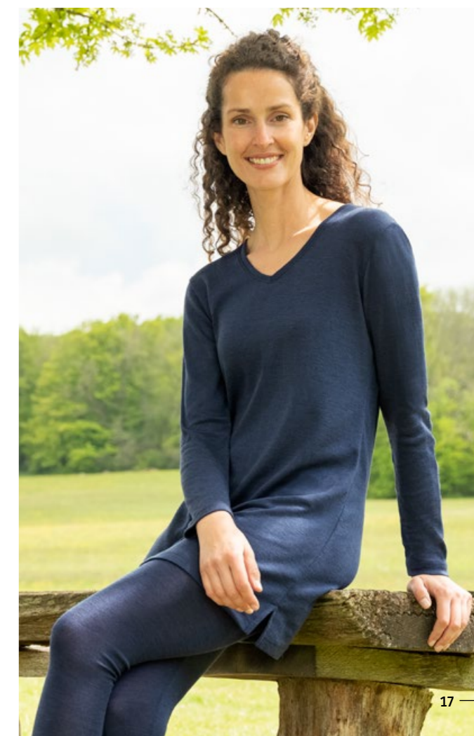
70 4952 66E - mauve