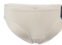
87 1310 01E – natural

● 100% cotton (organic), drop stitch sz. 34/36, 38/40, 42/44, 46/48