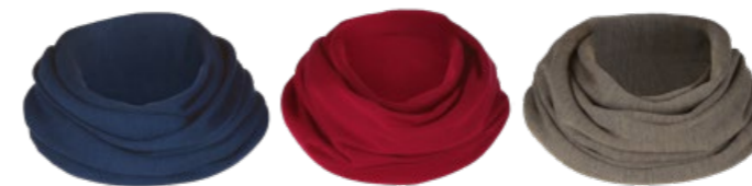
70 5594 33 – navy-blue

● 70% virgin wool (organic)/30% silk, fine rib sz. 1