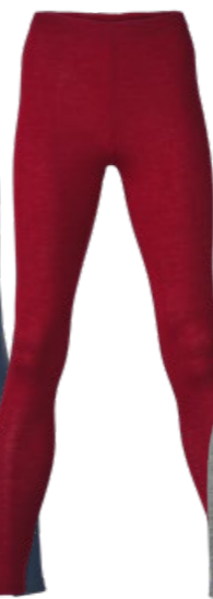
70 1500 66E - mauve