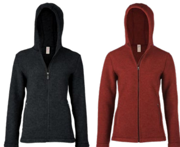
58 4421 090 – black mélange