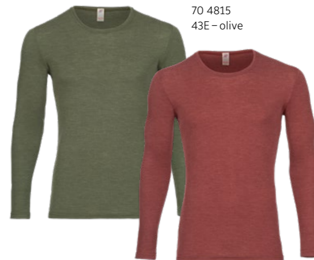
70 4815 43E – olive

● 70% virgin wool (organic)/30% silk, fine rib sz. 46/48, 50/52, 54/56