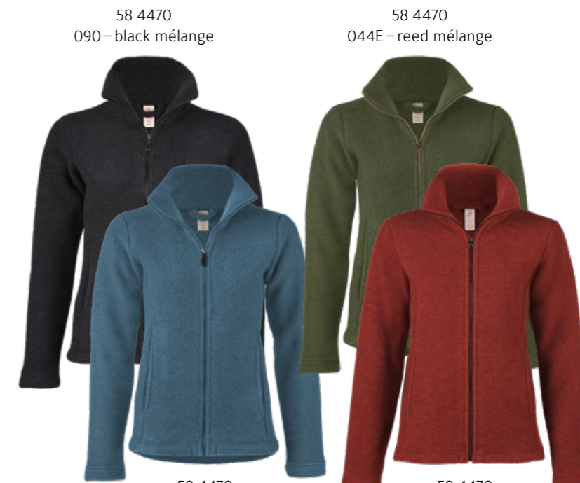
58 4470 090 – black mélange