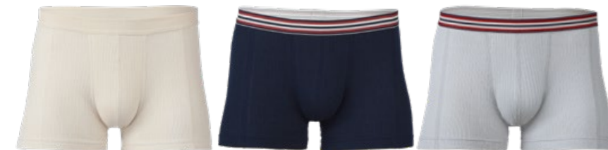
87 1795 01E - natural 87 1796 38E - indigo 87 1796 90E - silver

● 100% cotton (organic), drop stitch sz. 46/48, 50/52, 54/56