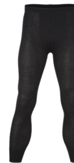
70 1940 09 - black

● 70% virgin wool (organic)/30% silk, fine rib sz. 46/48, 50/52, 54/56