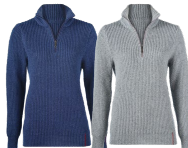
60 4401 32E – ocean 60 4401 92E – pebble

80% virgin wool (organic)/20% silk, half cardigan stitch sz. 34/36, 38/40, 42/44, 46/48