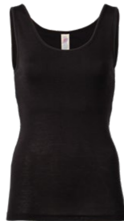
70 4012 09 - black

● 70% virgin wool (organic)/30% silk, fine rib sz. 34/36, 38/40, 42/44, 46/48