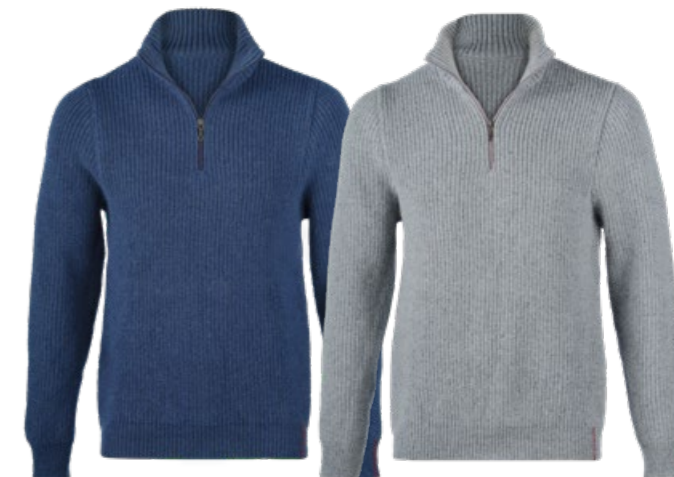
60 4402 32E – ocean 60 4402 92E – pebble

80% virgin wool (organic)/20% silk, half cardigan stitch sz. 44, 46/48, 50/52, 54/56