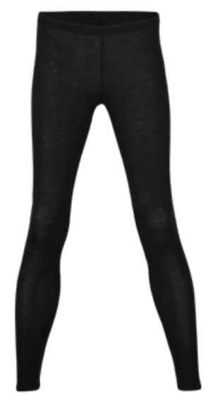
70 1500 09 - black