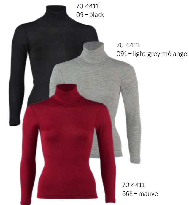
70 4411 09 - black

70% virgin wool (organic)/30% silk, fine rib sz. 34/36, 38/40, 42/44, 46/48