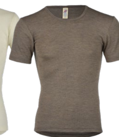
70 4800 75 - walnut