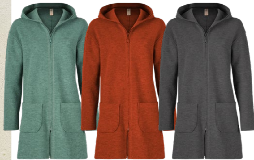
59 4499 032E – jade mélange 59 4499 072E – magma mélange 59 4499 096E – lava grey mélange

New quality! Ladies' coats made of boiled wool