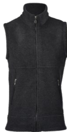
58 4488 090 – black mélange