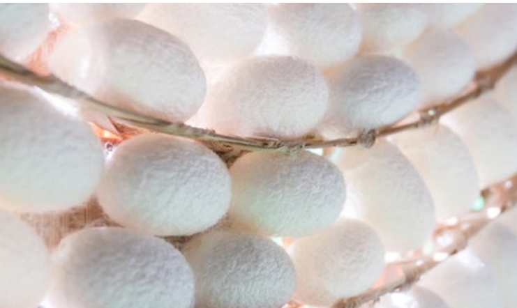
Silk – for a long, comfortable wearing experience