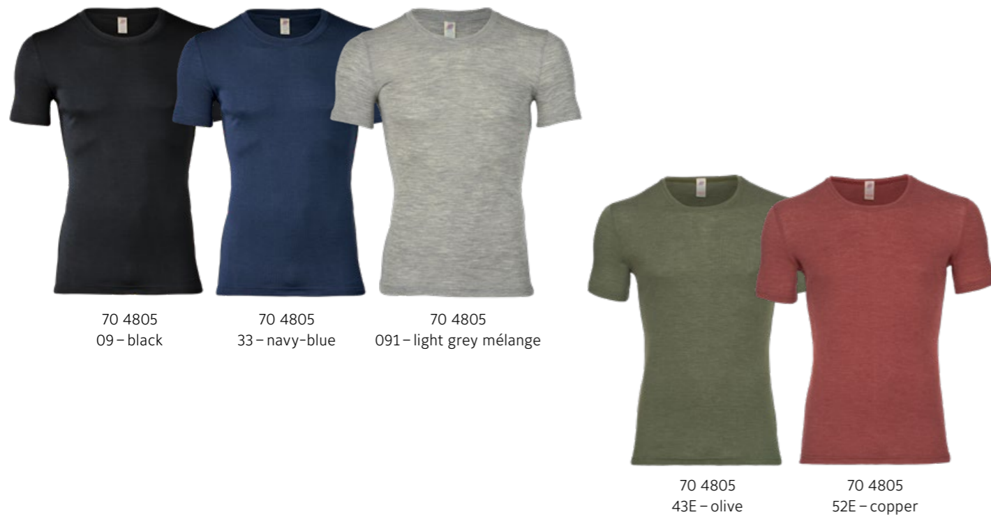
70 4805 09 – black 70 4805 33 – navy-blue 70 4805 091 – light grey mélangé

● 70% virgin wool (organic)/30% silk, fine rib sz. 46/48, 50/52, 54/56