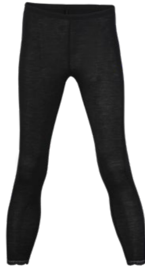
70 1510 09 - black

70% virgin wool (organic)/30% silk, fine rib sz. 34/36, 38/40, 42/44, 46/48