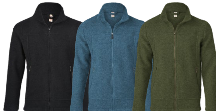
58 4430 090 – black mélange 58 4430 034E – atlantic mélange 58 4430 044E – reed mélange additional in sz. 58/60