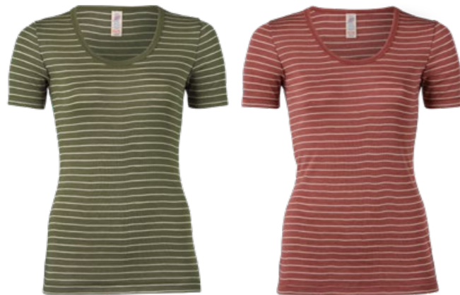
72 4875 4311E - olive/natural ringed

● 70% virgin wool (organic)/30% silk, fine rib sz. 34/36, 38/40, 42/44, 46/48