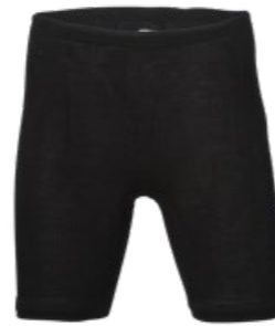
70 1320 09 - black