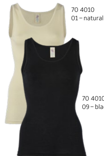
70 4010 01 - natural

● 70% virgin wool (organic)/30% silk, fine rib sz. 34/36, 38/40, 42/44, 46/48