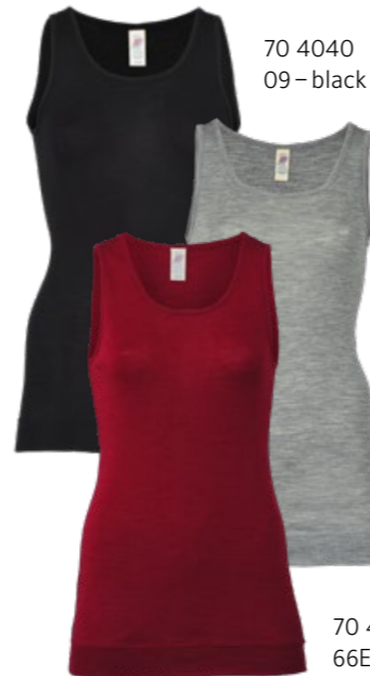
70 4040 09 - black

● 70% virgin wool (organic)/30% silk, fine rib sz. 34/36, 38/40, 42/44, 46/48