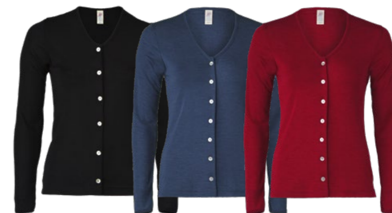
70 4441 09 – black

● 70% virgin wool (organic)/30% silk, fine rib sz. 34/36, 38/40, 42/44, 46/48