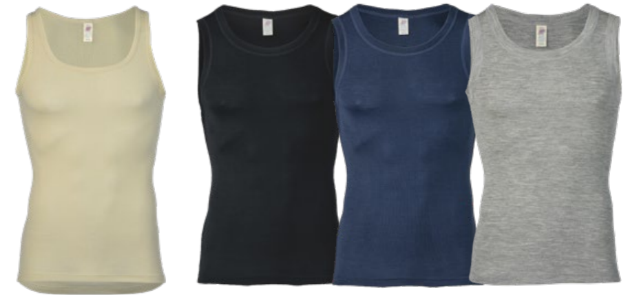
70 4000 01 - natural 70 4005 09 - black 70 4005 33 - navy-blue 70 4005 091 - light grey mélangé

● 70% virgin wool (organic)/30% silk, fine rib sz. 46/48, 50/52, 54/56