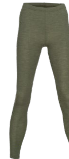
70 1500 43E - olive