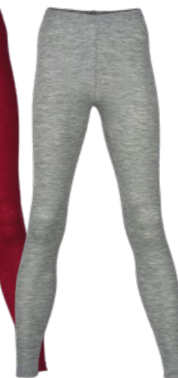
70 1500 091 - light grey mélange