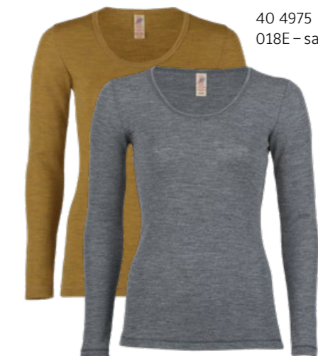
40 4975 018E - saffron mélangé

● 100% virgin wool (organic), fine rib sz. 34/36, 38/40, 42/44, 46/48