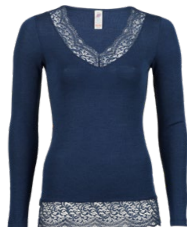
70 4895 33 - navy-blue

70% virgin wool (organic)/30% silk, fine rib sz. 34/36, 38/40, 42/44, 46/48