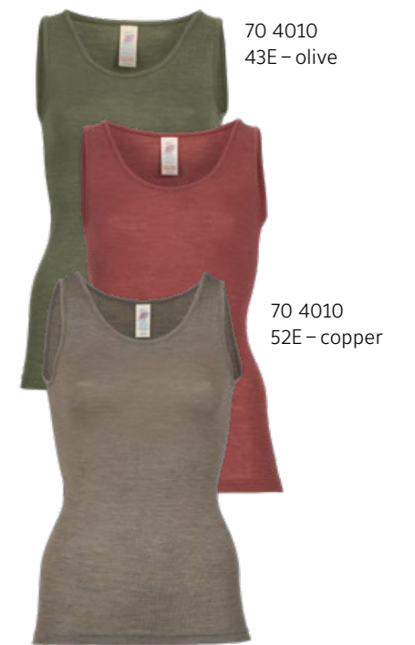
70 4010 43E - olive