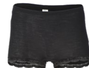
70 1330 09 – black

70% virgin wool (organic)/30% silk, fine rib sz. 34/36, 38/40, 42/44, 46/48