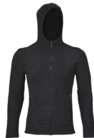
58 4422 090 – black mélange