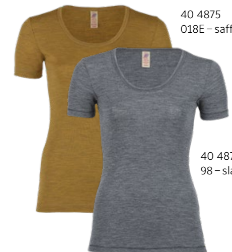
40 4875 018E - saffron mélange

● 100% virgin wool (organic), fine rib sz. 34/36, 38/40, 42/44, 46/48