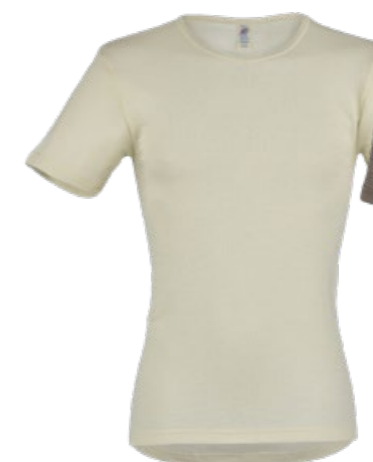
70 4800 01 - natural

● 70% virgin wool (organic)/30% silk, fine rib sz. 46/48, 50/52, 54/56