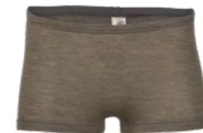
70 1340 75 – walnut