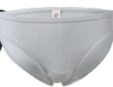
87 1310 90E – silver