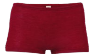
70 1340 66E – mauve