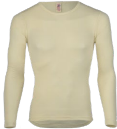
40 4814 01 – natural

● 100% virgin wool (organic), fine rib sz. 46/48, 50/52, 54/56