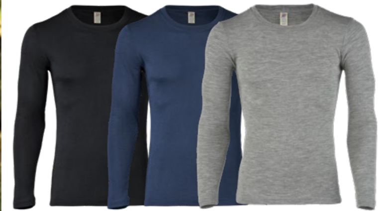
70 4815 09 – black

● 70% virgin wool (organic)/30% silk, fine rib sz. 46/48, 50/52, 54/56