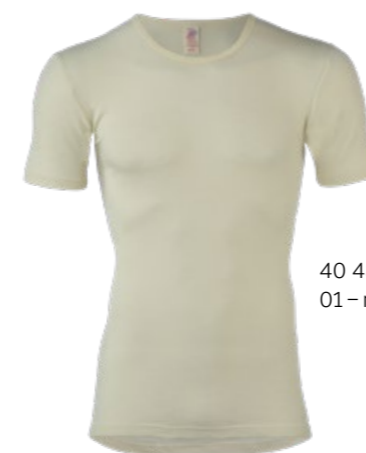
40 4804 01 - natural

● 100% virgin wool (organic), fine rib sz. 46/48, 50/52, 54/56