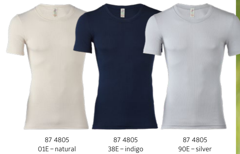
87 4805 01E – natural 87 4805 38E – indigo 87 4805 90E – silver

● 100% cotton (organic), drop stitch sz. 46/48, 50/52, 54/56