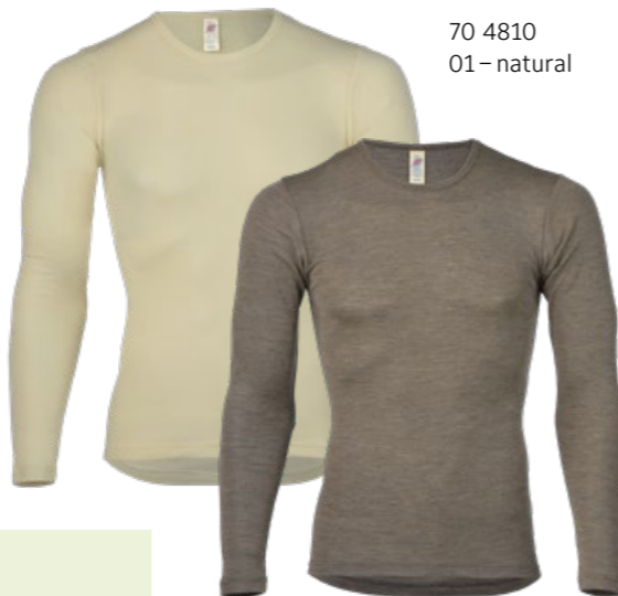
70 4810 01 – natural

● 70% virgin wool (organic)/30% silk, fine rib sz. 46/48, 50/52, 54/56