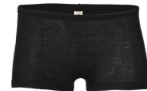
70 1340 09 – black

● 70% virgin wool (organic)/30% silk, fine rib sz. 34/36, 38/40, 42/44, 46/48