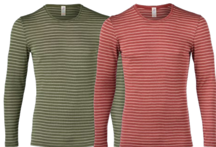
72 4815 4311E – olive/natural ringed

● 70% virgin wool (organic)/30% silk, fine rib sz. 46/48, 50/52, 54/56