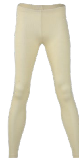
70 1500 01 - natural

● 70% virgin wool (organic)/30% silk, fine rib sz. 34/36, 38/40, 42/44, 46/48