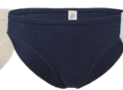
87 1310 38E – indigo