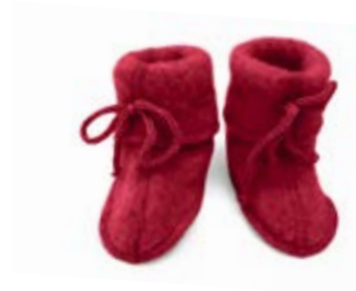
575582 052E- jasper mélange