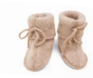
575582 087E- sand mélange