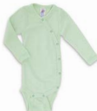
709510 40E- pastel mint

Baby body long sleeved, with press-studs on the side