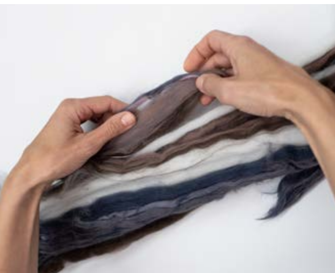
The mixture of merino wool and silk that is typical of Engel

We produce our clothing exclusively in Germany in accordance with the highest ecological and social criteria.