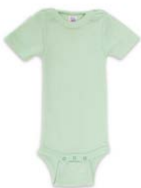
709020 40E- pastel mint

Baby body short sleeved, with press-studs on the shoulders