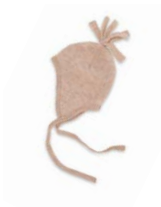
575450 087E- sand mélange