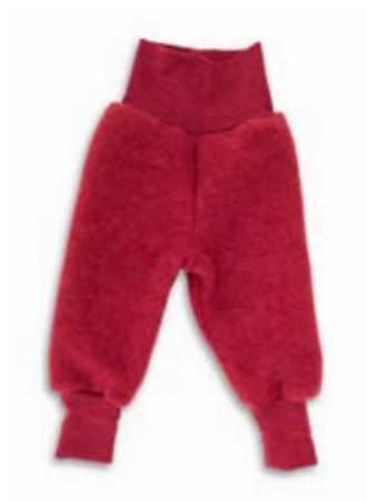
573501 052E- jasper mélange