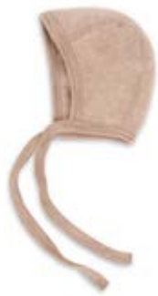
575550 087E- sand mélange