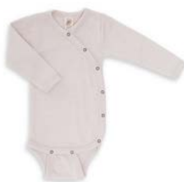
709510 53E- magnolia

Baby body long sleeved, with press-studs on the side