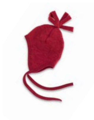
575450 052E- jasper mélange