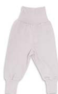
703501 53E- magnolia