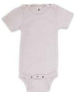
709020 53E- magnolia

Baby body short sleeved, with press-studs on the shoulders