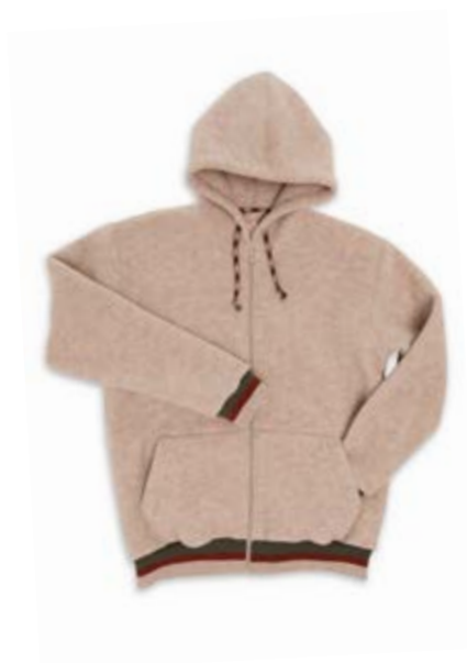
584423 087€- sand mélange