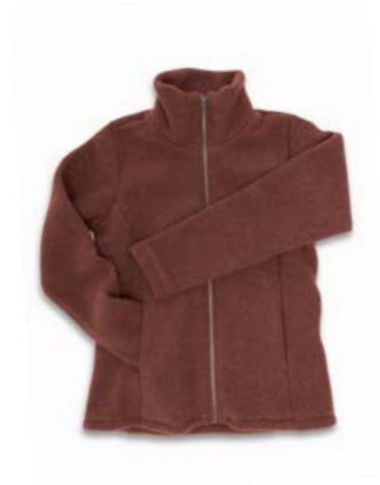
584470 079€- cinnamon mélange