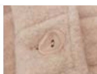
Real tagua nut buttons