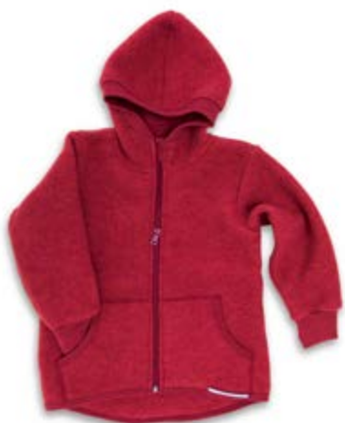
575423 052E- jasper mélange