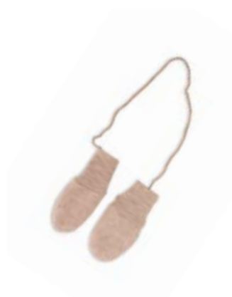
575570 087E- sand mélange