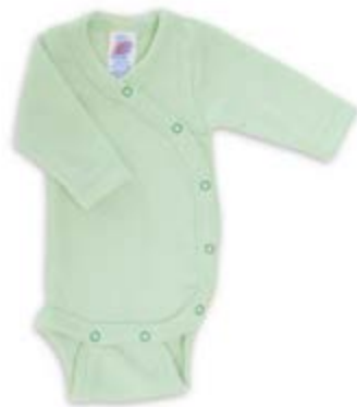
700960 40E- pastel mint

Premature: baby body long sleeved, with press-studs on the side