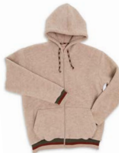
584424 087E- sand mélange