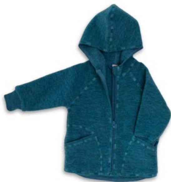
595521 035E- pacific mélange