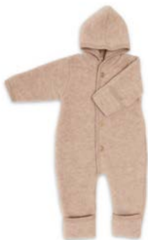
575722 087E- sand mélange