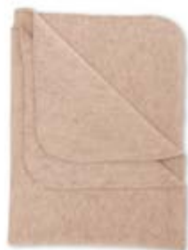
578501 087E- sand mélange