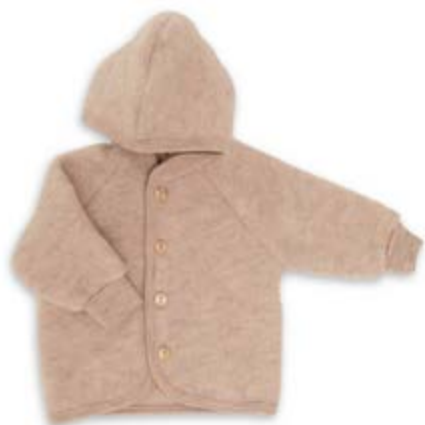
575520 087E- sand mélange