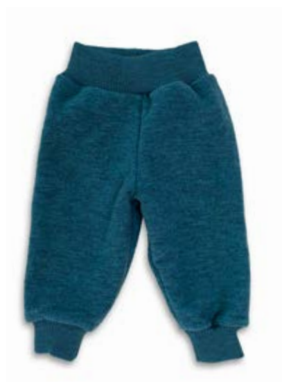
593600 035E- pacific mélange