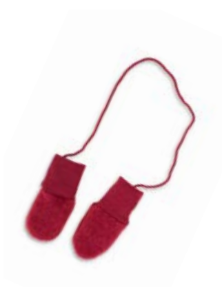
575570 052E- jasper mélange