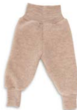
573501 087E- sand mélange