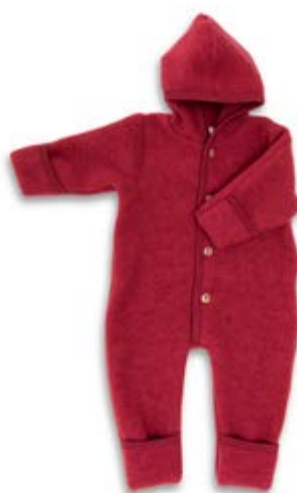
575722 052E- jasper mélange

Hooded overalls with wooden buttons, with cuffs to close at the arms and the legs