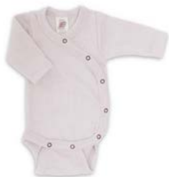
700960 53E- magnolia

Premature: baby body long sleeved, with press-studs on the side