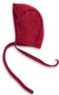
575550 052E- jasper mélange