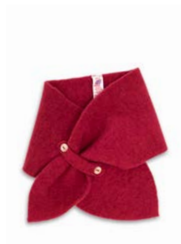
575596 052E- jasper mélange