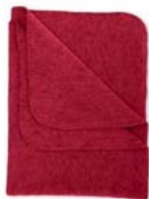
578501 052E- jasper mélange