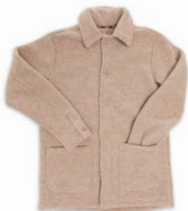
584311 087E- sand mélange