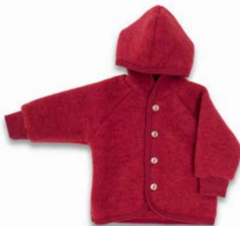
575520 052E- jasper mélange