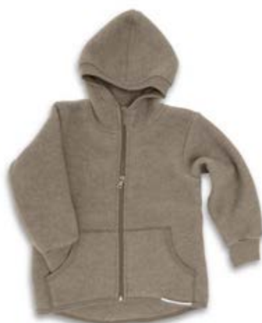
575423 075 - walnut mélange