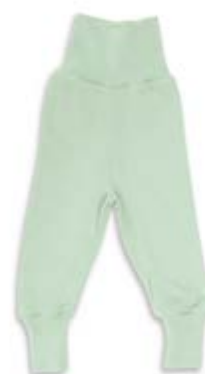
703501 40E- pastel mint